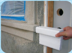
K 180 The robust & reliable render mask