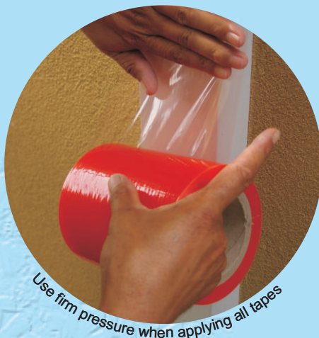
Use firm pressure when applying all tapes