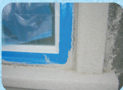
Excellent for holding PE sheet to frames

This tape has been specially developed for the professional renderer as a masking tape that can be used with confidence* in all situations with all types of render. Unlike crepe paper tapes and common cloth tapes the Tenacious K180 has a special adhesive engineered to cope with the heat, UV and humidity encountered in Australia. Its heavy duty construction allows it to strip cleanly for up to a minimum of 14 days outdoors and can be used as a direct masking edge and holding PE sheeting in place.