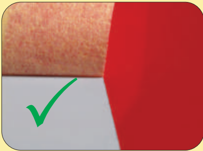
K750 Clean Edge Strip Finish