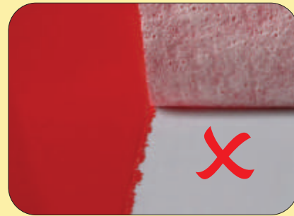
Standard Masking Tape Finish